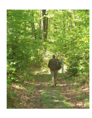
Out on the trail