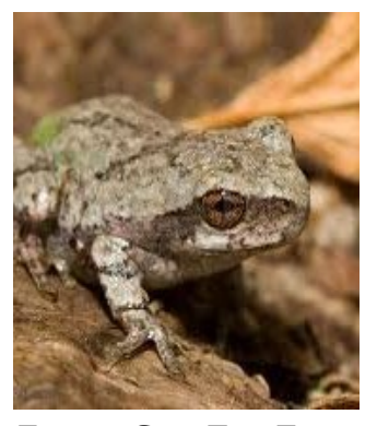
Eastern Grey Tree Frog